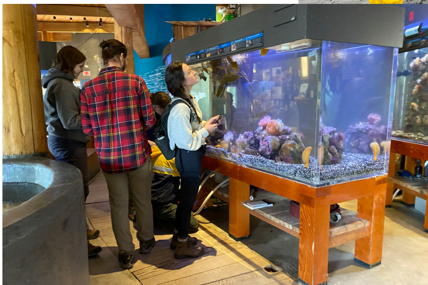
Observing organisms as part of their labs at the Ucluelet Aquarium