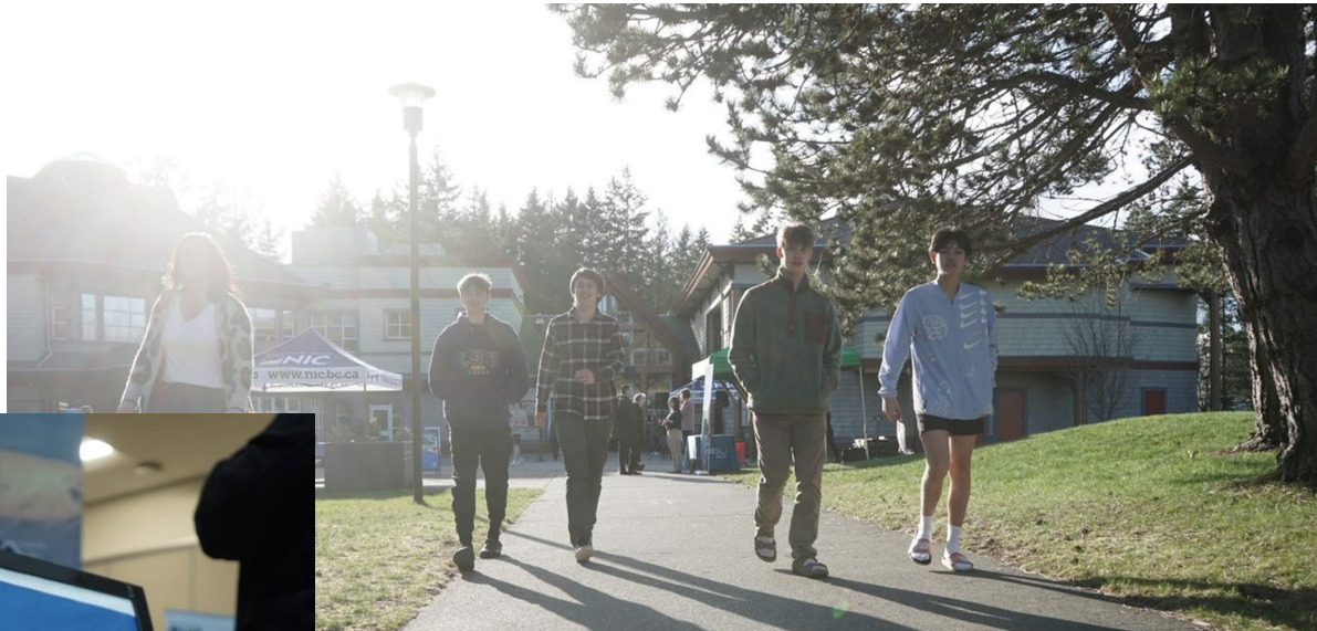
March 29, Port Alberni ~ 250 attendees

March 22, Comox Valley ~ 400-500 attendees, additional 84 attended keynote speaker