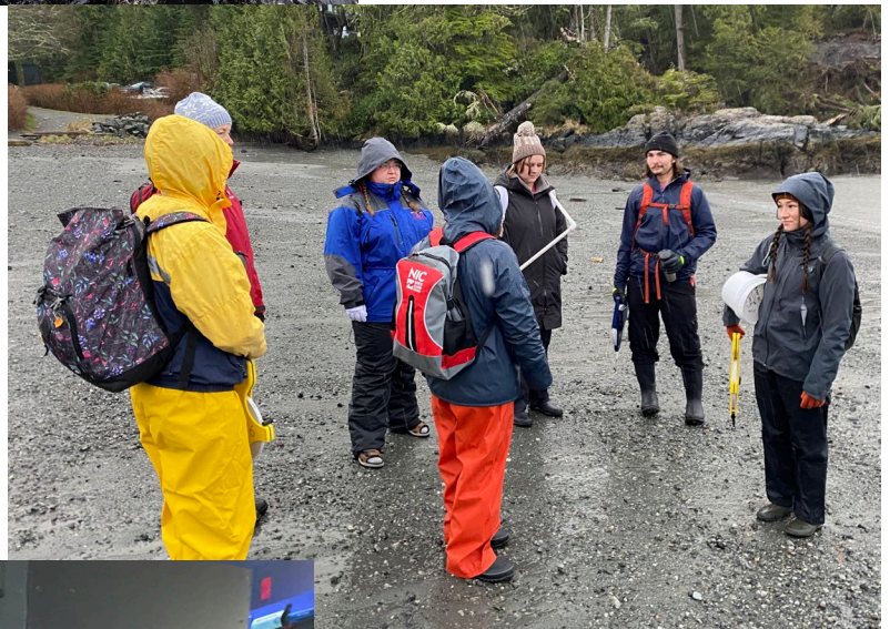
Site briefing prior to collecting data (in the rain and hail!) at Little Beach