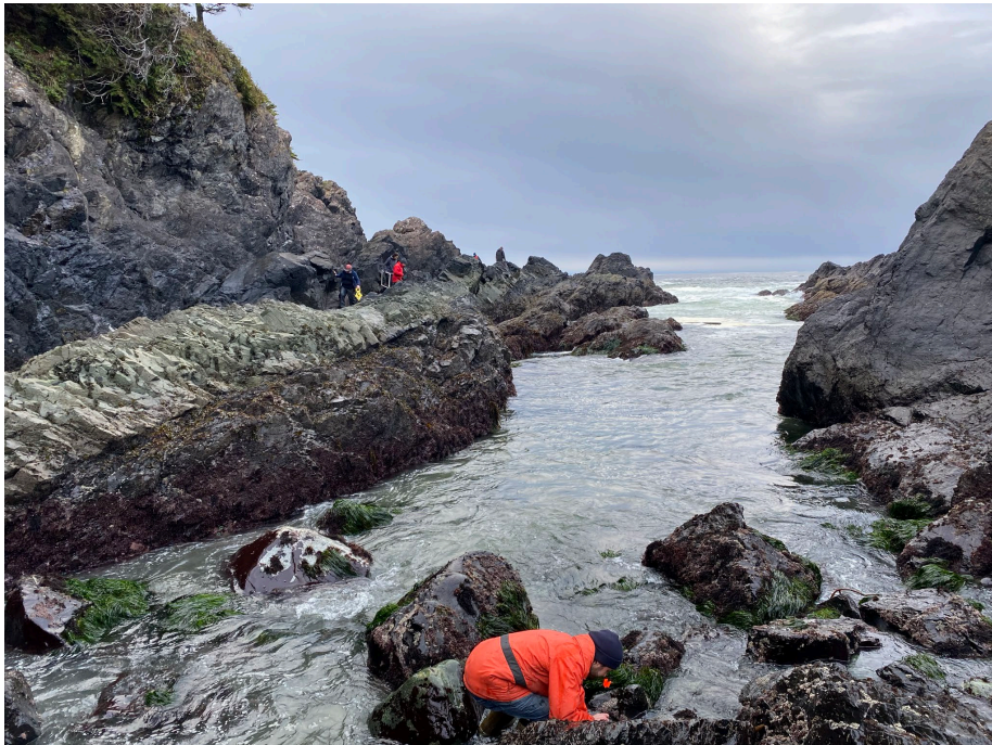
Collecting data and setting up transects at Brown's Beach – students found at various spots along the water's edge.