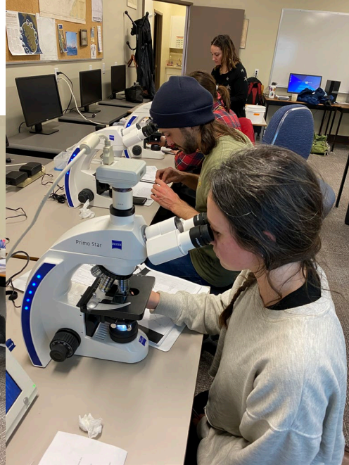
Collecting urchin gametes and observing embryonic development under the microscope.